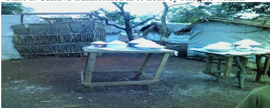
Plate 1: Cassava transformed into flour by refugees women

The fermented cassava is put in a sac with small outlet on it to enable water come out during pressing. In cases where the quantity of cassava is small they use their hands to press it. In cases where the cassava is much, a heavy object is put on it for water to come out. The semi dry cassava dough is put on a mat and allowed to dry under the heat of the sun. The transformed cassava is ground into flour and stored in containers for household or commercial purpose.