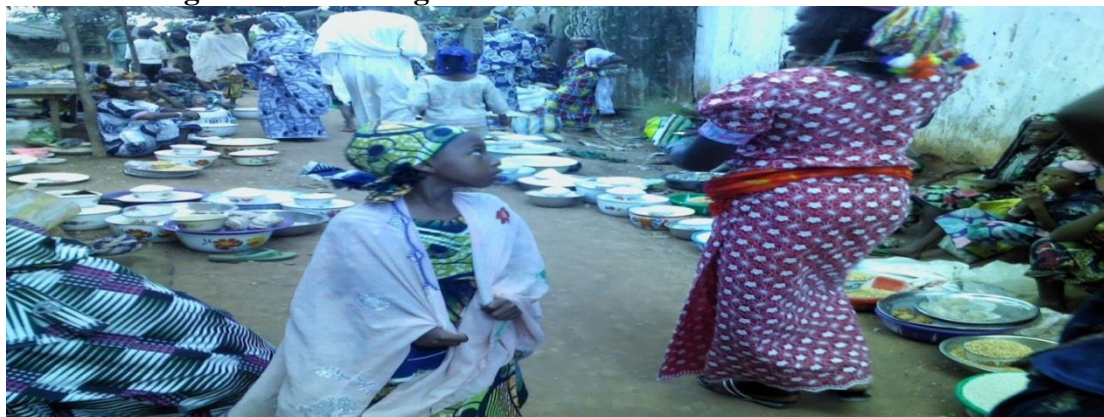
Plate 4: Refugee women selling food ration received from WFP