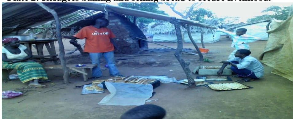
Plate 2: Refugees baking and selling bread to secure livelihood.

After production, buyers come around to collect and supply to small store owners around the site. These refugees made us to understand that, the money they get from this activity enable them to produce more bread and employ more people in the industry. This also helps them to generate income that can be used to buy drugs at the hospital and to seek better health care out of the refugee site. Having their own money from the sale of bread enable them to be less dependent on the assistance they receive from donor agencies, since the assistant does not come in regularly.