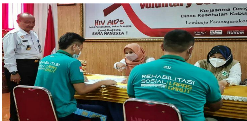
Figure 1. Examination HIV/AIDS in Prisons

Even from study as stated in Ref. [9] mention the negative impact from sex deviation behavior that they could have pressure permanently which is psychically happened in their life and even after they could have bad image from the society and the environment, so it would be